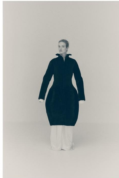
Capofila di Isaac Mizrahi , Armani di Armani, Cossentino