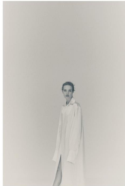
Chiosato di seta, seta e organza.