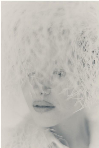
Cappello di lana, Jacquemus. Inforcina, Chloé e riciclatoria e green di lana, Comme des Garçons. Camicia Comme des Garçons. Borsa vintage hollow, Issey Miyake. Prada.