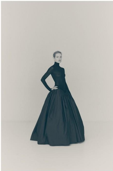
Mani posate di tulle e body di lycra. Abito.