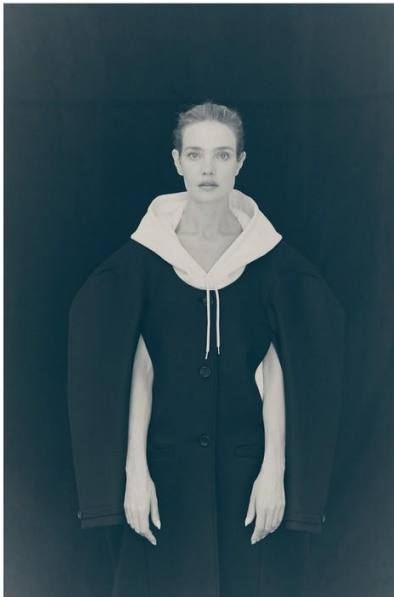
Capofila di Isaac Mizrahi di Armani, Cossentino