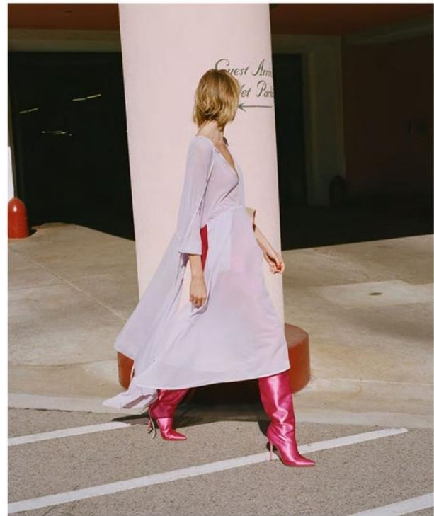
THE SELF SERVICE V.M. SPRING/SUMMER 2017