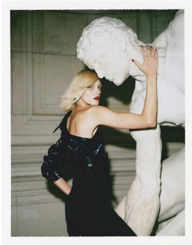
Body asymétrique en coton enduit, et pantalon taille haute en gabardine de laine, MAX MARA. Maquillage Yves Saint Laurent Beauté avec l'Encre de Peau All Hours Foundation BB0, le Full Maître Shadoz: Fiery Coral, le mascara Volume Effet Faux Cils The Carler Noir Innomis, le Rouge Pur Couture The Slim Red Evergiva et, sur les ongles, la Laque Couture Rouge Pop Art. Page de gauche, top volanté en tulle plumeux, velours et strass, et pantalon en laine et soie, Dsquared2. Ceinture en cuir, Dundas.