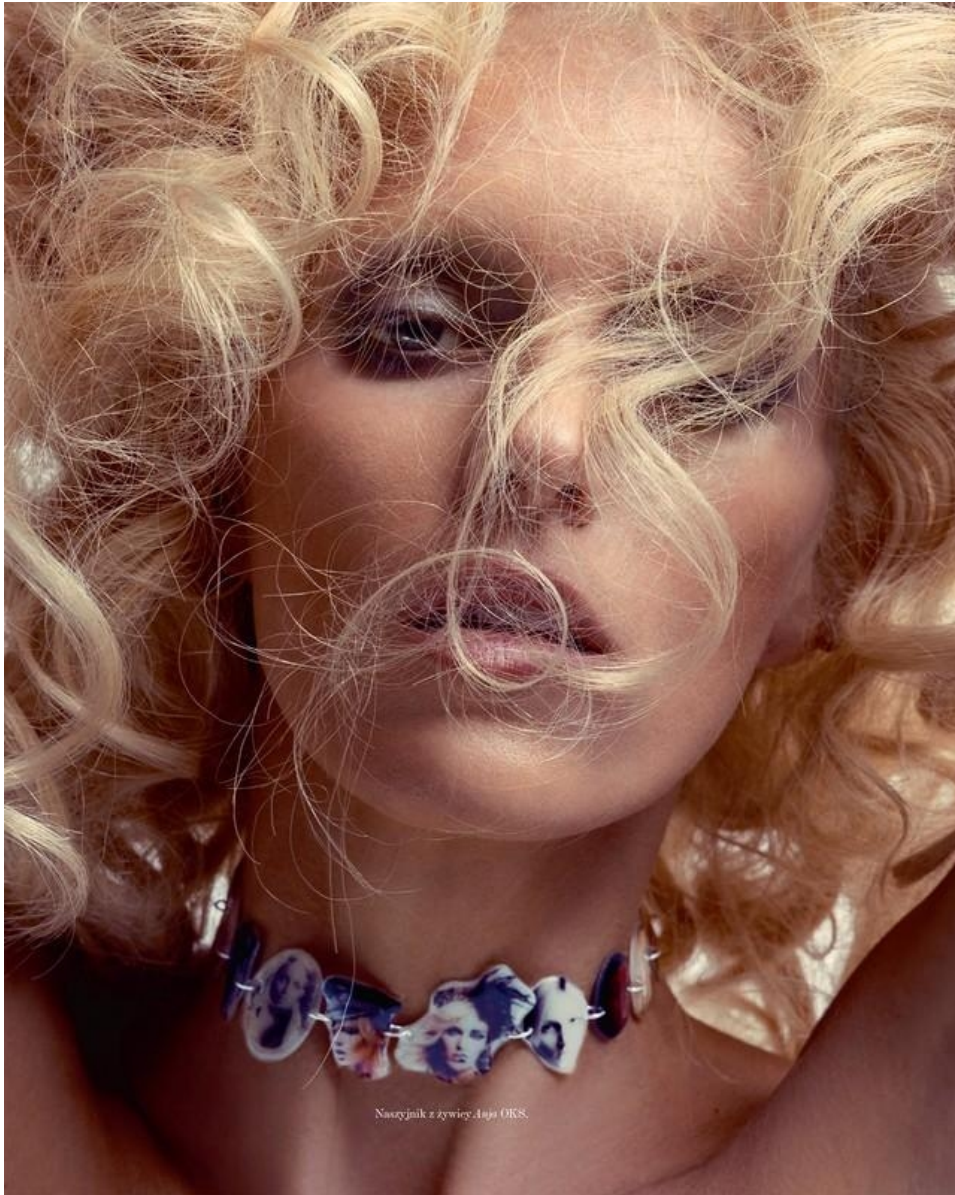
Naszyjnik z żywicy Anja ORS.